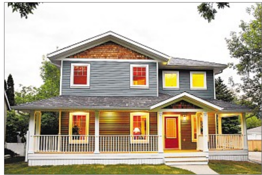
Walls of solid concrete aren't visible in this award-winning Dabro Homes house.