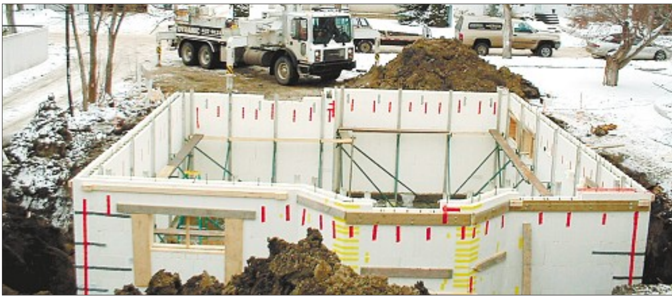
The building process involves pouring cement into polystyrene forms, which remain in place as part of the walls.