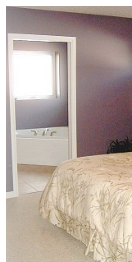
Master bedroom, looking toward the ensuite entrance.