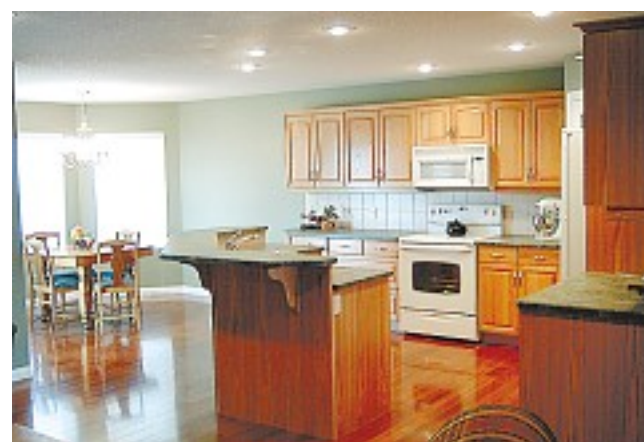
Island kitchen features oak cabinets.