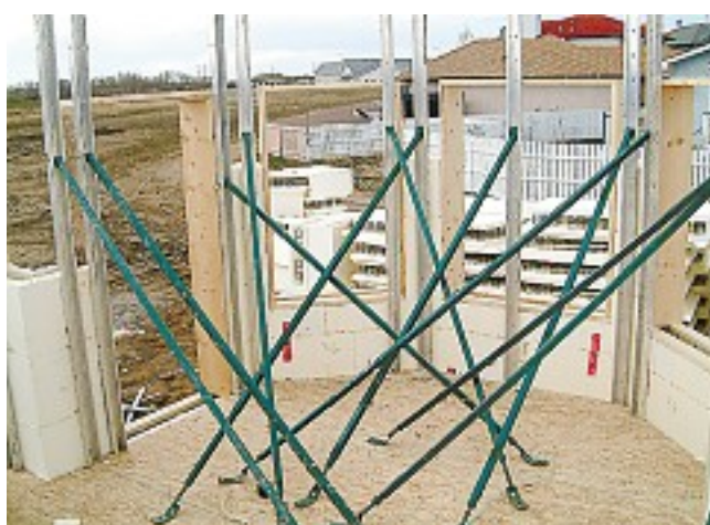
Super-solid construction of Dabro’s Wetaskiwin showhome includes poured concrete and rebar.

Cost-effective material saves homeowners up to 50 per cent on heating bills