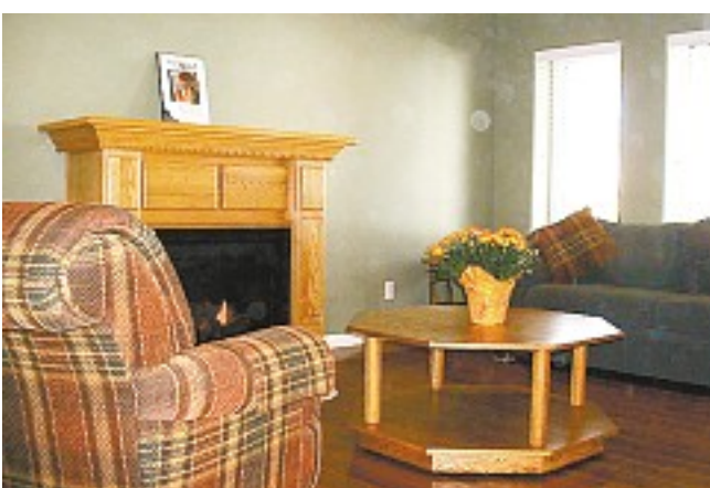
Thicker walls cut into available floor space, but only slightly.